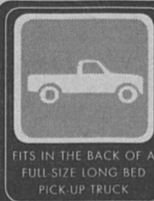
FITS IN THE BACK OF A FULL SIZE TRUCK PICK-UP TRUCK