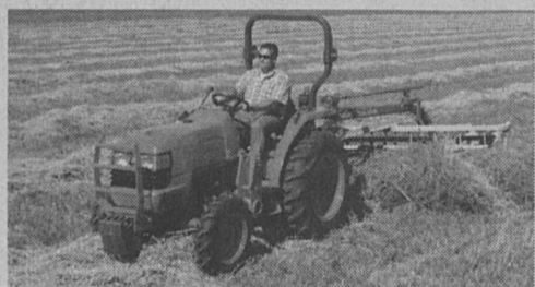
L3400 35.7 HP, 3-CYLINDER KUBOTA DIESEL ENGINE

0% A.P.R. FINANCING FOR UP TO 42* MONTHS ON SELECT NEW KUBOTAS!