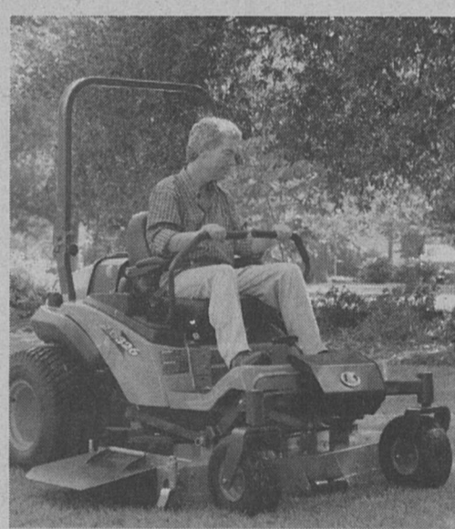
ZD326 26 HP, 3-CYLINDER KUBOTA DIESEL ENGINE