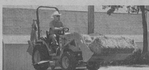
B2920 29 HP, 3-CYLINDER KUBOTA DIESEL ENGINE