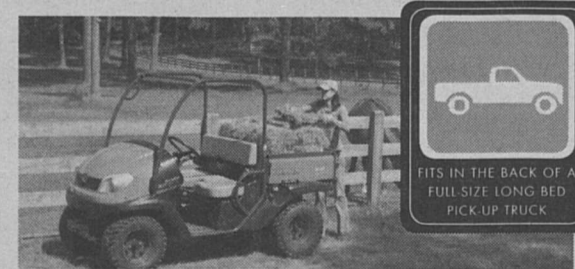
RTV500 15.8 HP, 2-CYLINDER KUBOTA GASOLINE ENGINE